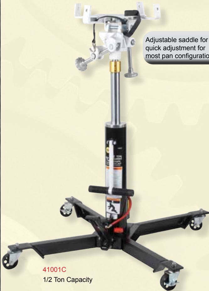
41001C 1/2 Ton Capacity

Adjustable saddle for quick adjustment for most pan configurations