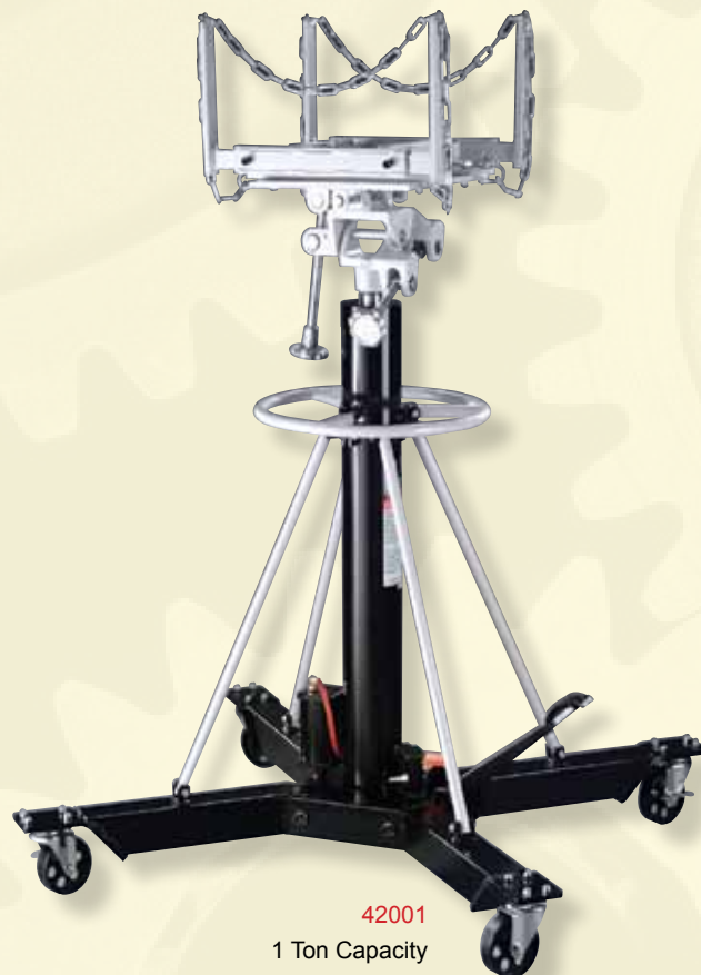
42001 1 Ton Capacity

Adjustable saddle for quick adjustment for most pan configurations